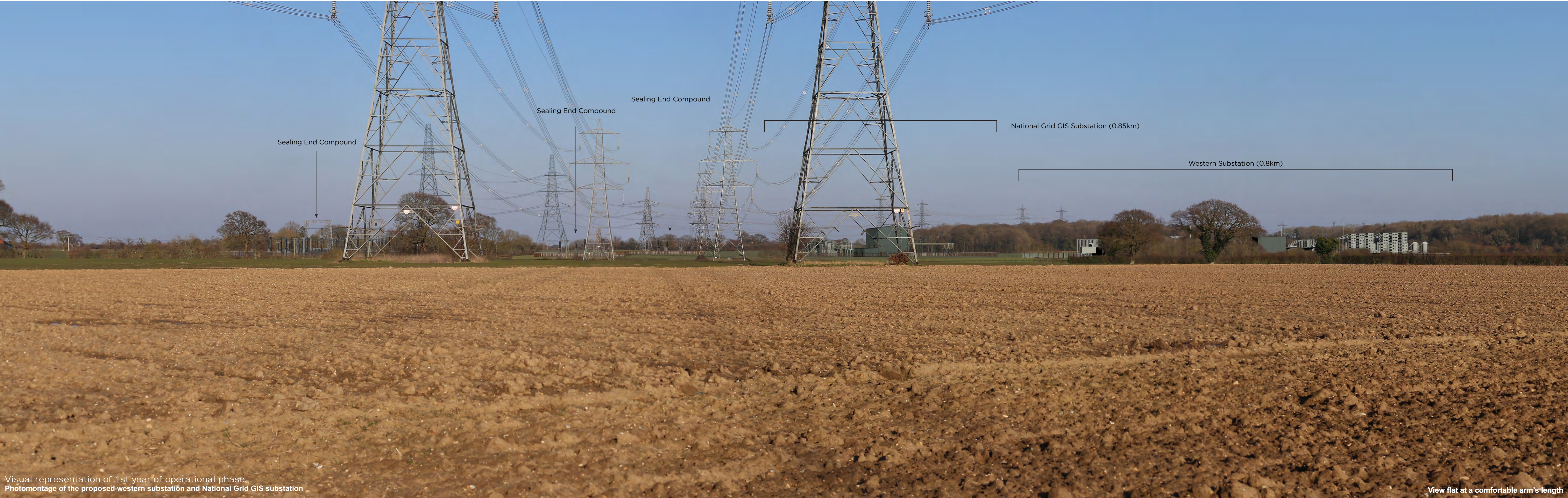
Visual representation of 1st year of operational phase Photomontage of the proposed western substation and National Grid GIS substation